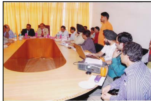
Hon'ble Dy. Chief Minister reviewing the progress of JMC