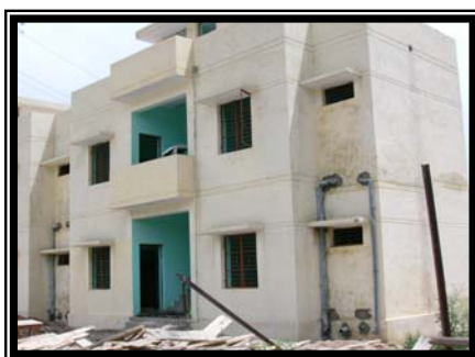
Work started on 352 units