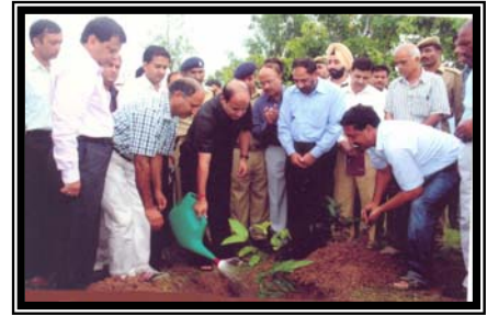
Sh. Tara Chand, Hon,ble Dy. CM during inauguration of Plantation drive

With the endeavor to make the City Clean and Green, Jammu Municipal Corporation took the initiative for plantation of trees during monsoon season.