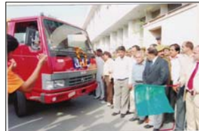
Hon'ble Dy. C.M. flagging off New Vehicles