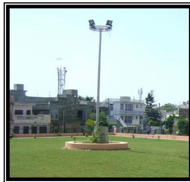
Sheed Bhagat Singh Park