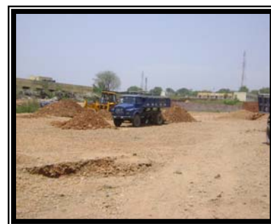
36 units for Kusht Ashram